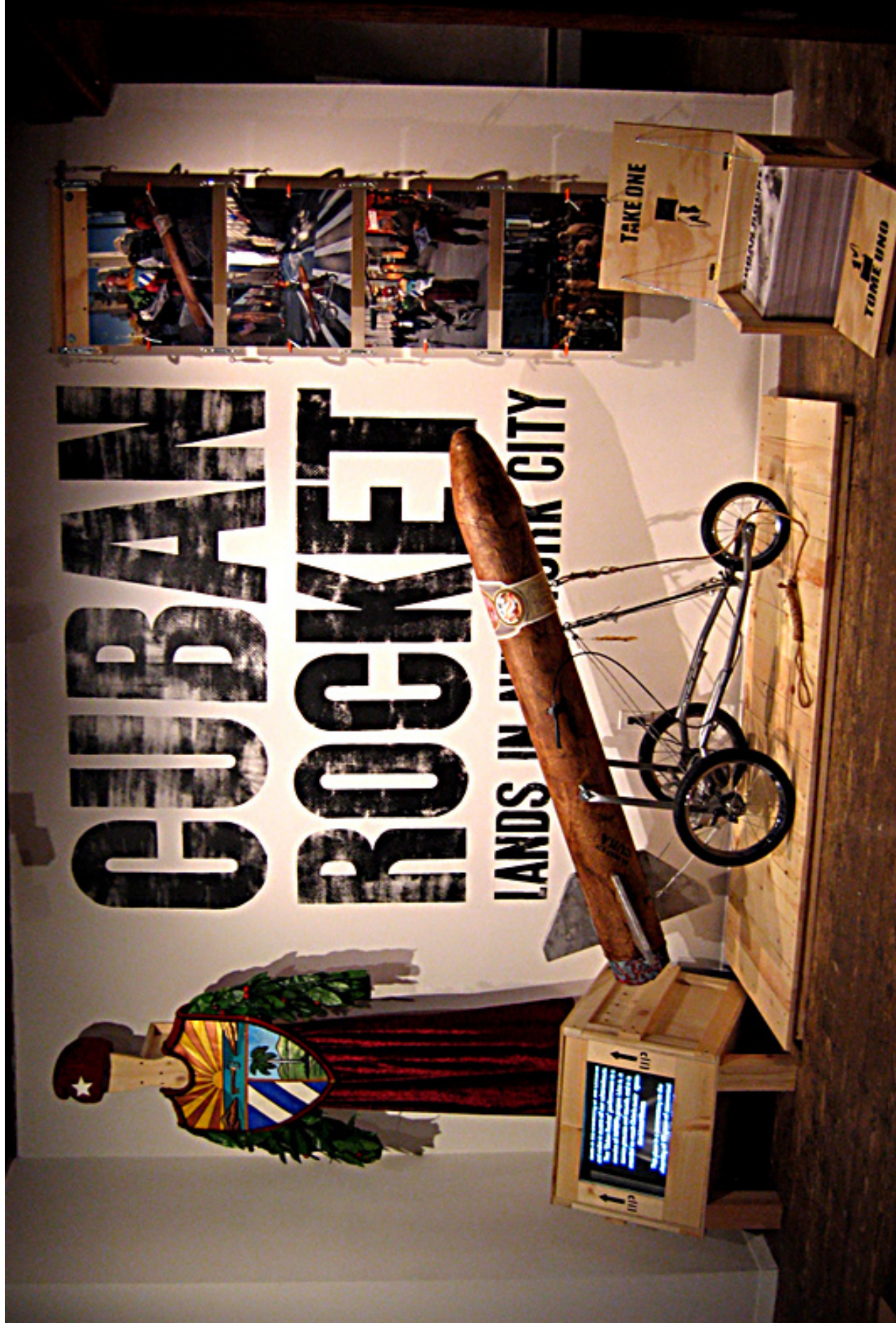
"Cuban Rocket..." as it was presented at Hunterdon Museum of Art in Clinton, New Jersey. January 2008.

From left to right: the video, costume, the prop, the photos and the flyers.